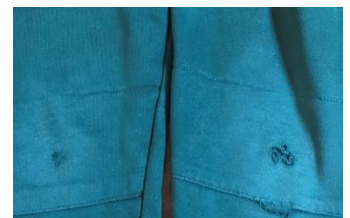
Holes and wear marks