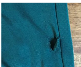
2cm square rip