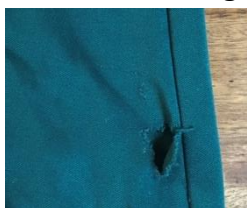
2cm square rip